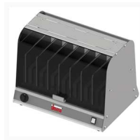
Vista UVC 24W TH