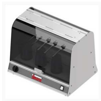
Vista UVC 16W SH